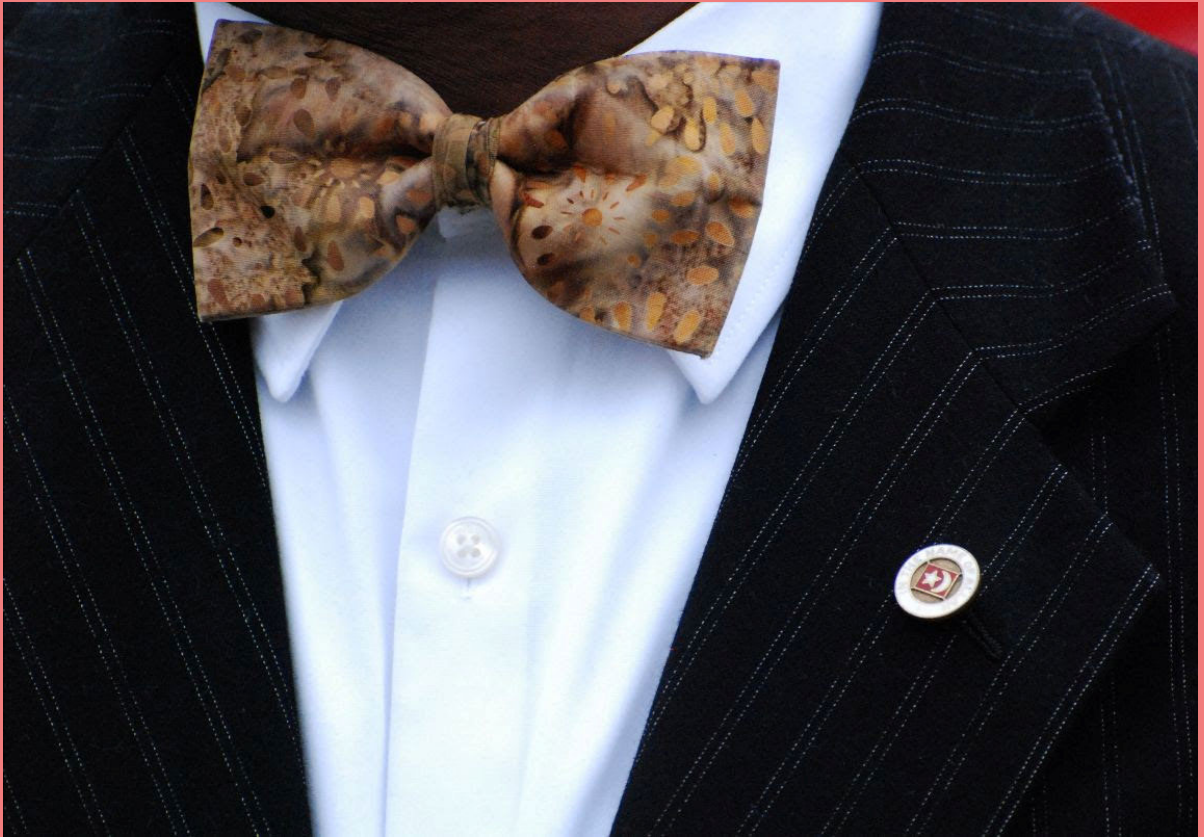
Fruit of Islam at the Eric Garner Protest, Staten Island, NY