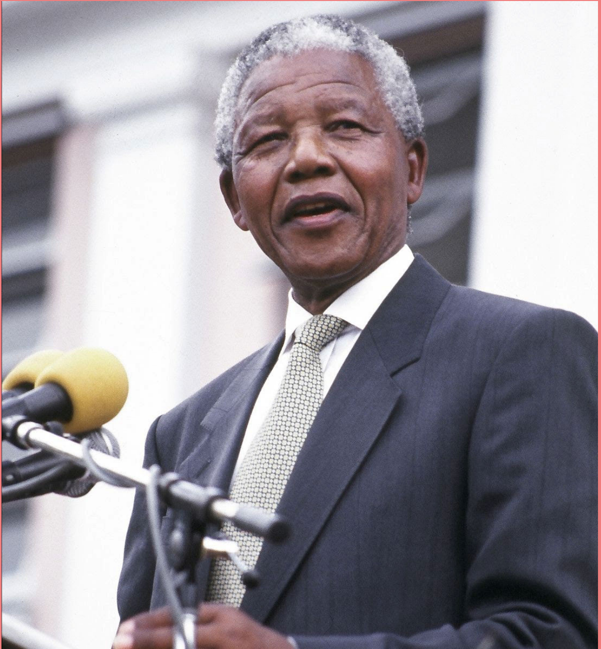
Nelson Mandela in the Bahamas