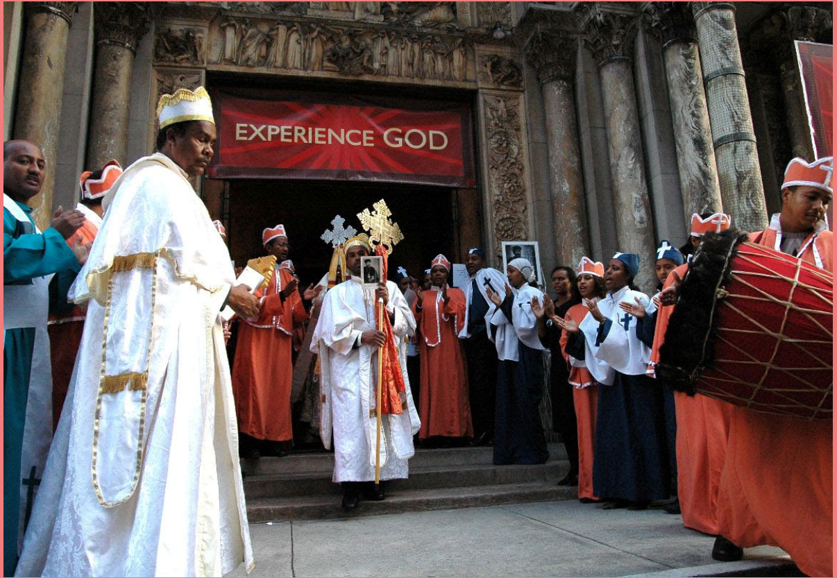
The funeral of Archbishop Yesehaq, New York